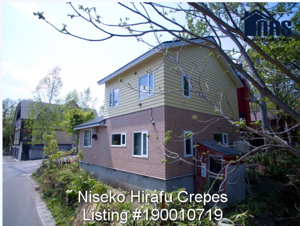
Niseko Hirafu Crepes Listing #190010719